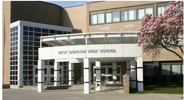
The district has a high school, middle school and five grade schools.